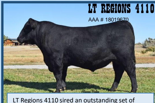
LT REGIONS 4110 AAA # 18019670

Sitz Asset 402C is one of Resource's best sons to date. This larger framed bull will add performance and style. Watch for his sons in our 2018 sale.