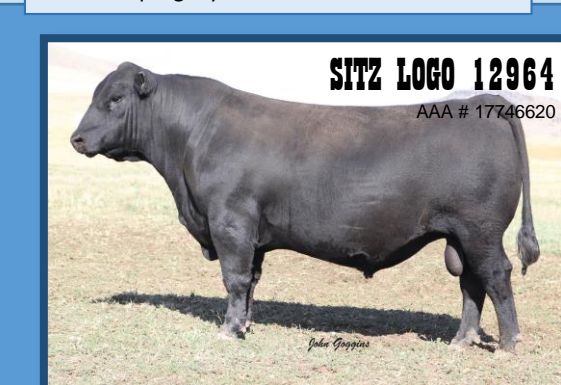
SITZ LOGO 12964 AAA # 17746620

Sitz Investment 689B is a growth bull in every sense of the word. He will add frame and pounds to your calf crop.