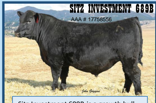
SITZ INVESTMENT 689B AAA # 17758556

LT Regions 4110 sired an outstanding set of calves; they look to have lots of muscle, but still had moderate birthweights. This docile sire has tremendous shape, a big hip, straight back and exceptional feet. We are extremely excited about his progeny.